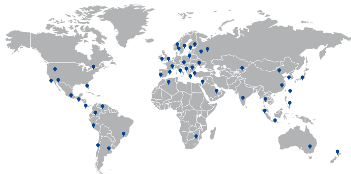
Epson's global service network

Epson CoverPlus offers a range of service and support options so you can choose the level of support you need, or let us work out a bespoke solution based on your needs or budgets. With an extensive global service network and a track record of exceeding our clients' expectations, our commitment to service is second to none.